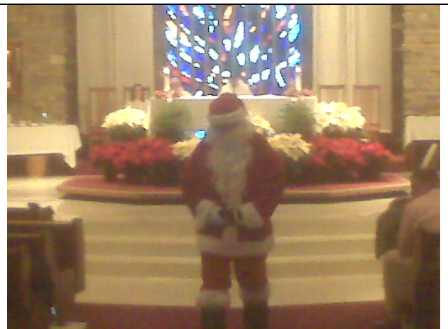
Once again Santa visited the Creche at Christmas Masses.