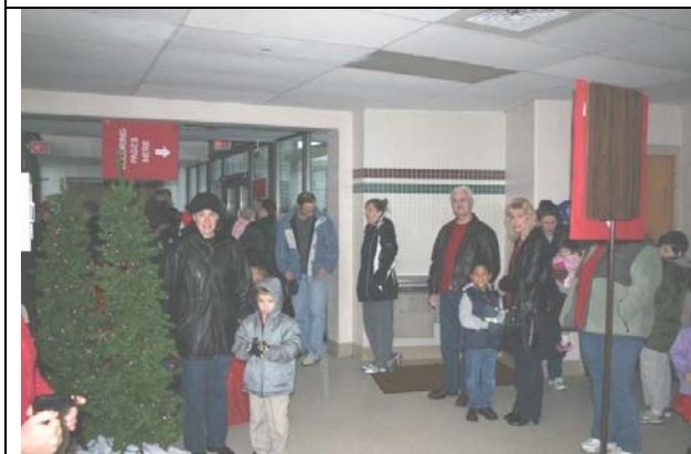
Breakfast with Santa guests