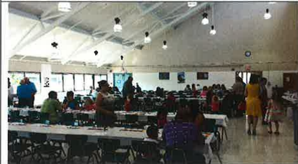
The breakfast season got off to a good start in September