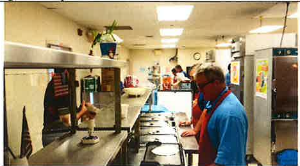
Brother Knights gleefully serving breakfast