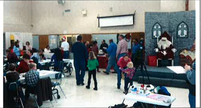
Weeks of planning all came together smoothly