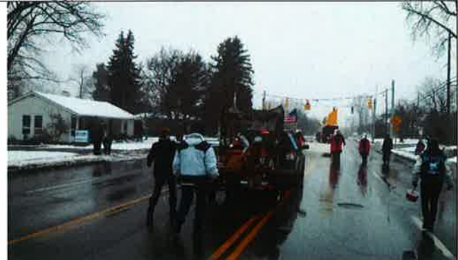
The roles of Mary and Joseph were once again critical to the message