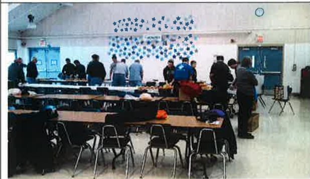
Super Subs were assembled at a fevered pitch