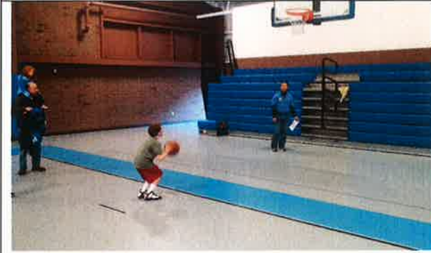
Once again, there was good shooting at the Free Throw Contest