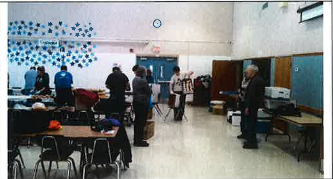
The level of enthusiasm was contagious