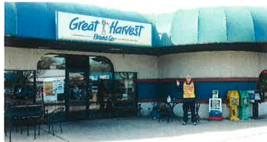
...and the people coming and going at Great Harvest were happy to give