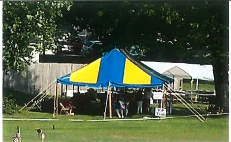
20 ft by 30 ft tent. Rental $375 for a weekend. It requires a flat area of 60 ft by 50ft for staking and supports