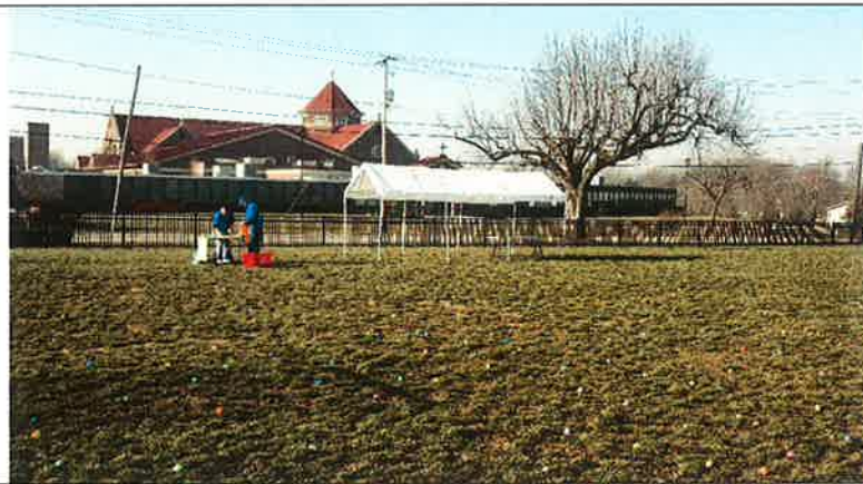
8 by 20 tent with flaps (not shown). Rental $90 for a weekend.