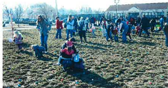
There were more than 200 kids, and no eggs were left unaccounted for!!!