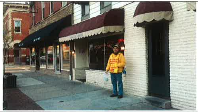
Once again we were out in force for Measure Up