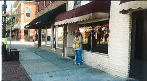
It's difficult to resist the donuts and coffee when standing outside Schneider's bakery