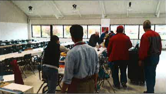
All hands were on deck making super subs