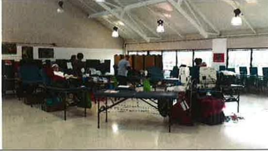
Under the guidance of Curtis Smith the blood drive was once again a success