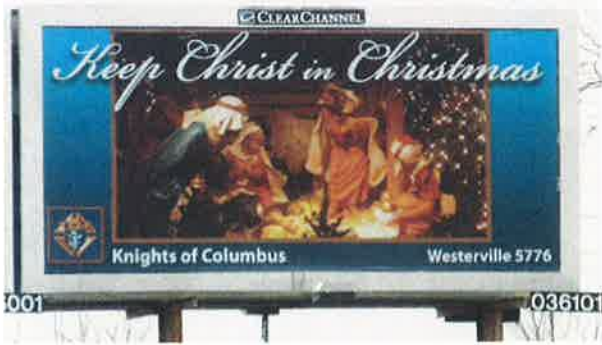
The Council billboard at the intersection of Route 161 and Westerville Road