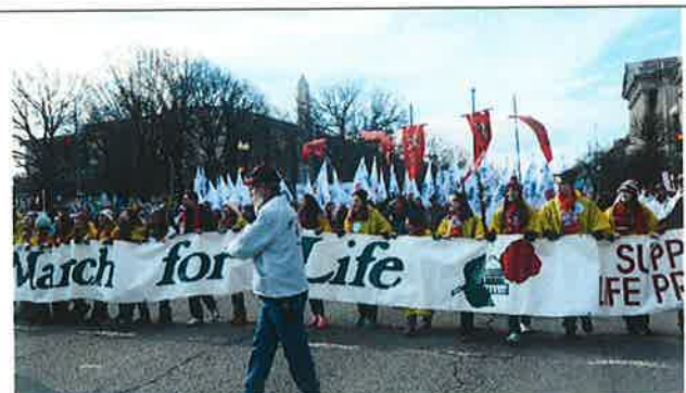
....along with a multitude of young adults from all across the United States