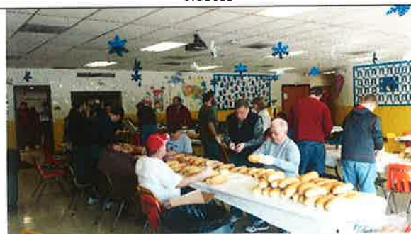
All hands were gloved and on deck making subs