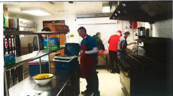
Even in the kitchen