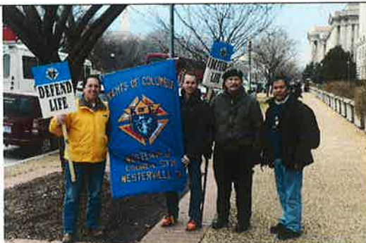
The Council was well represented in Washington for the March for Life