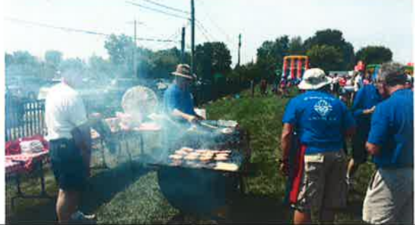
Making sure the attendees were fed