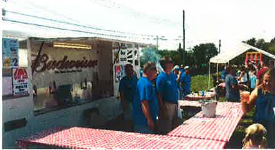
Making sure the attendees were hydrated