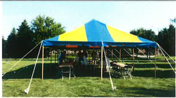
Members busy setting up the tent for the Parish Picnic