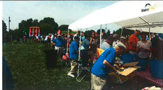
Knights serving people