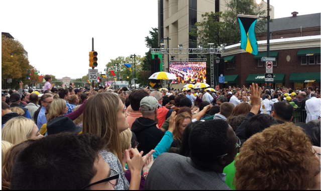
Over 800 priests distributed Holy Communion