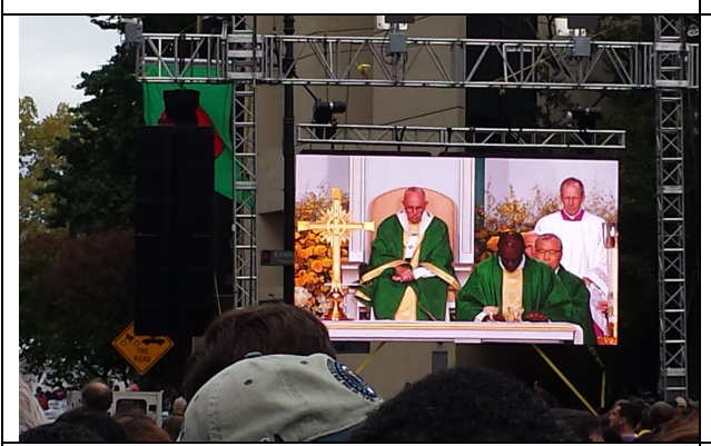
850,000 people listen in silence to every word of the Pope's message