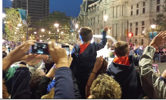
The spiritual energy in the crowd as the Pope road past was awesome