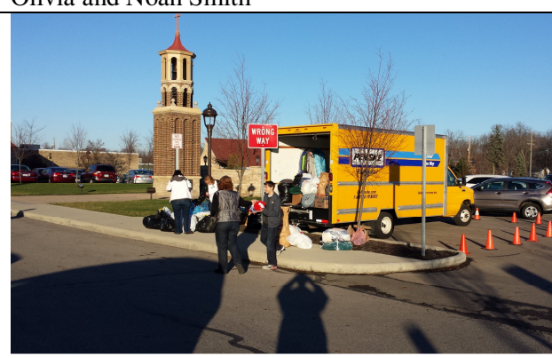
The Council donation of Coats for Kids was taken by the St Paul Youth Ministry to Cranks Creek, KY