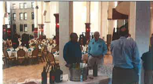
All hands were on deck for helping with the Bethesda Healing Ministry dinner