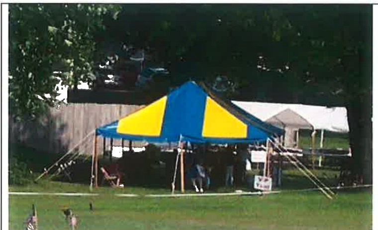
20 ft. by 40 ft. tent. Rental $375 for a weekend. It requires a flat area of 40 ft. by 60ft for staking and supports