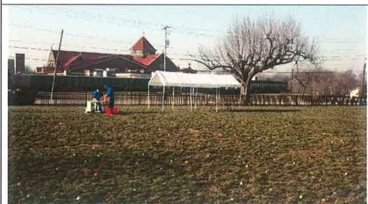
10 by 20 tent with flaps (not shown). Rental $185 for a weekend. 10x20 does not need additional area