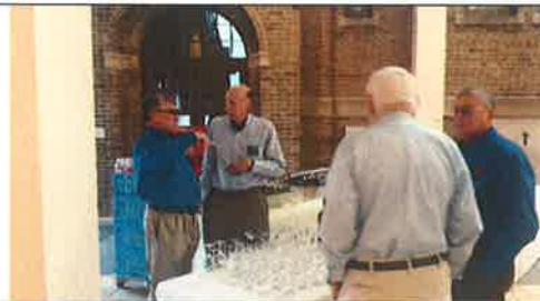
The Council members were gracious hosts for the event