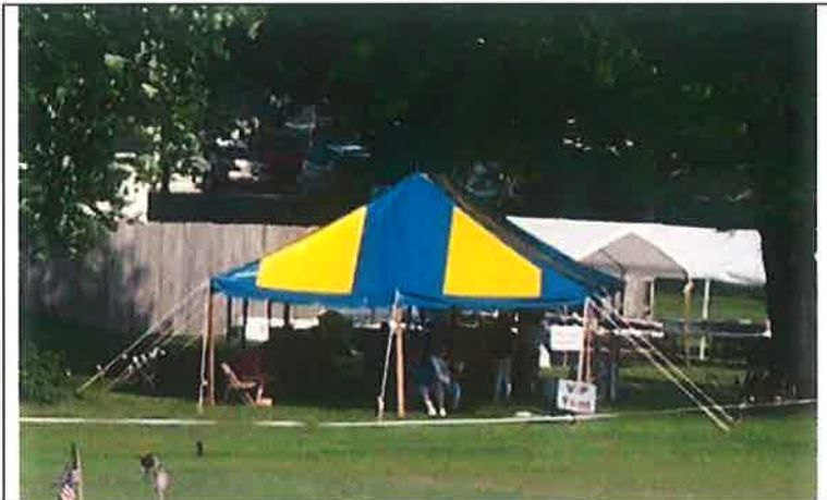
20 ft. by 40 ft. tent. Rental $375 for a weekend. It requires a flat area of 40 ft. by 60ft for staking and supports