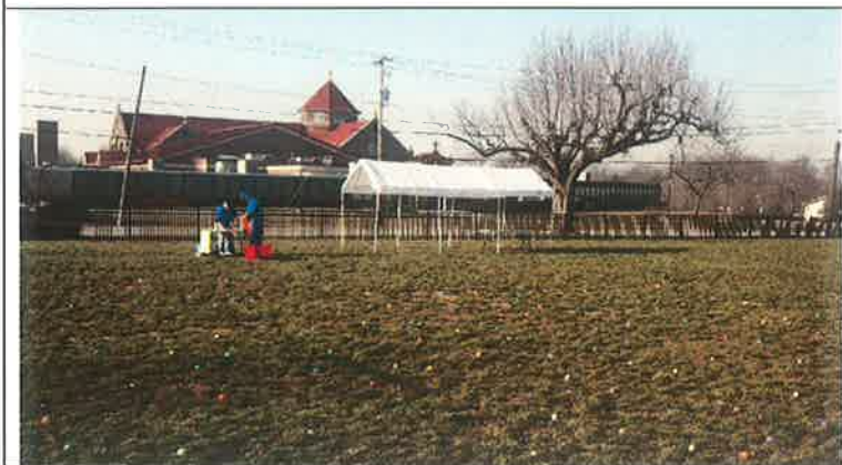
10 by 20 tent with flaps (not shown). Rental $185 for a weekend. 10x20 does not need additional area