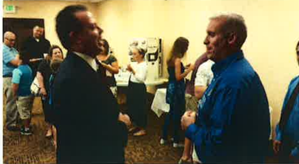
The Council hosted Donut Sunday