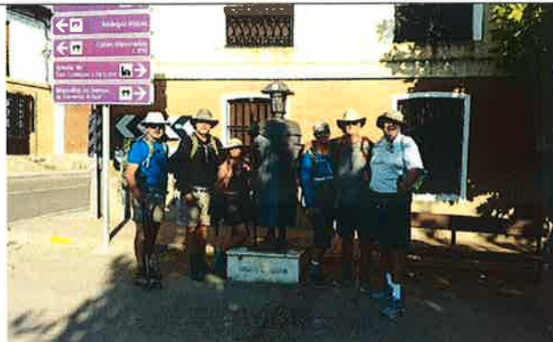
Meeting other pilgrims