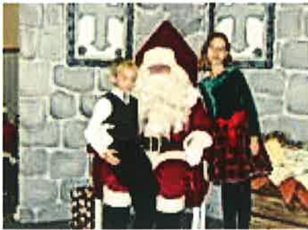
Breakfast with Santa December 10