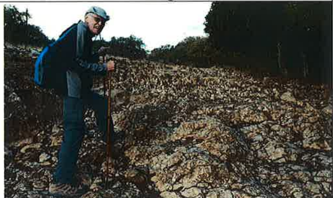
Hiking the way