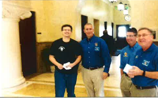
The Open House on Nov 16 was successful