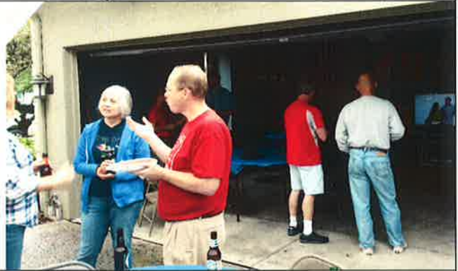
Fraternity abounded as the Buckeyes were winning