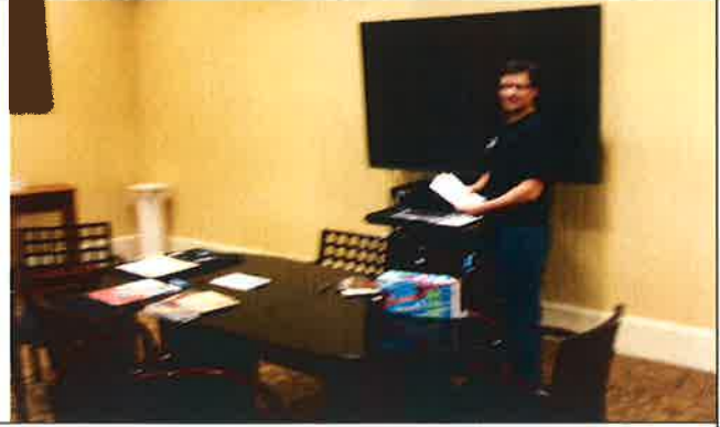
There was plenty of information available for men who attended