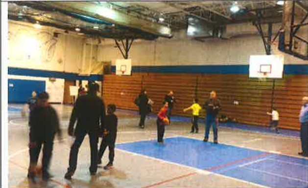
More than 50 kids participated