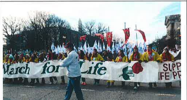
...along with a multitude of young adults from all across the United States