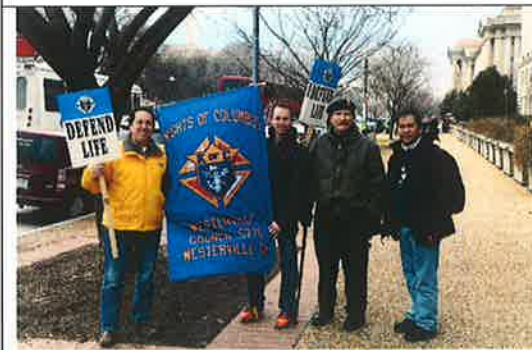
The Council was well represented in Washington for the March for Life