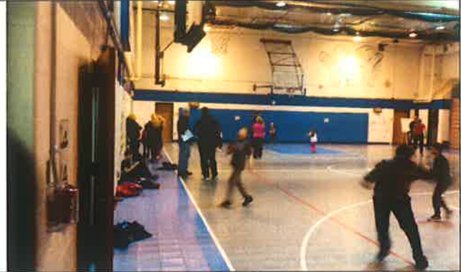
It was an enjoyable event