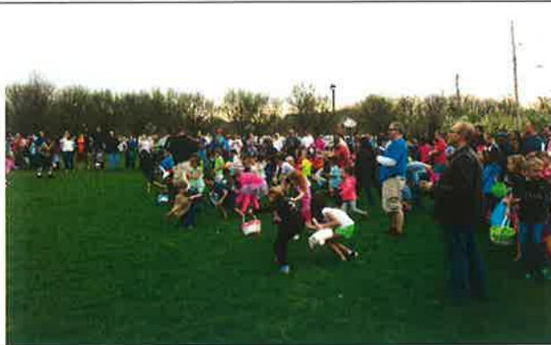
The crowd anxiously waited for the go signal and then hit the field