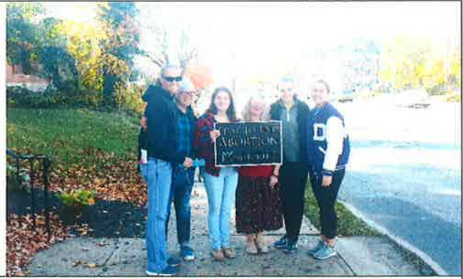
Knights and family members prayed the Rosary outside the abortion clinic during the 40 Days for Life