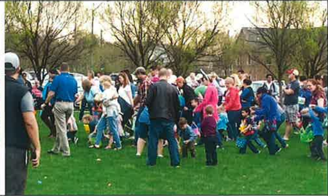
It was over in twenty minutes