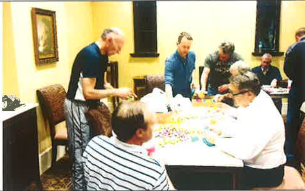
Carefully preparing the eggs for The Hunt