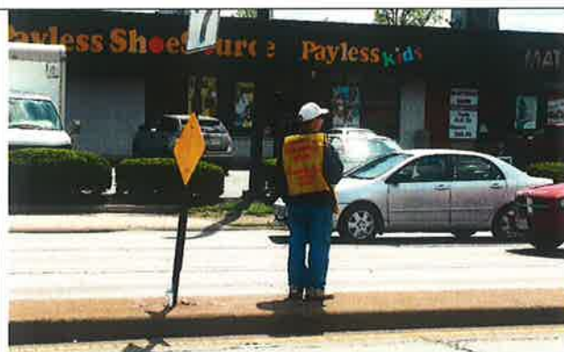
Rocky Lomano collecting