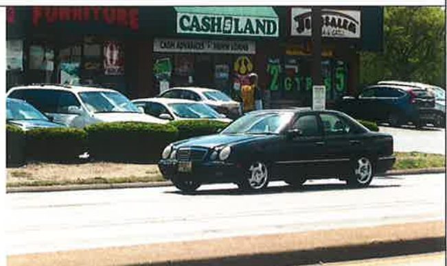
Henry Vidal collecting