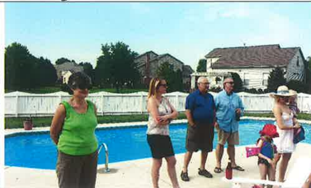
The celebration was enjoyed by all