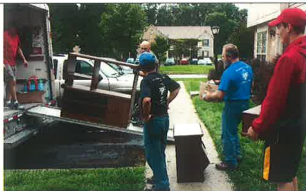
More than 20 brother knights, family, and friends helped move parishioners in need