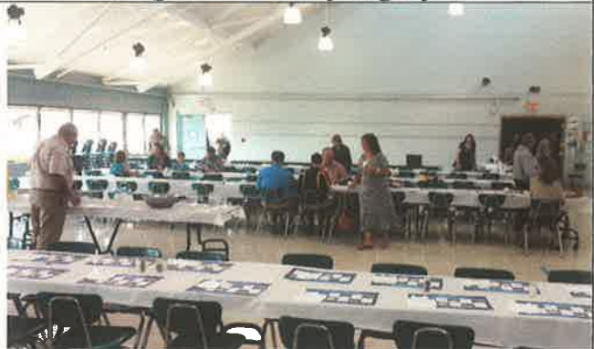
In spite of the construction at St Paul School, there were still good crowds at the breakfast