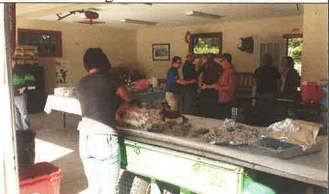
The Council Pig Roast was once again a memorable event ( www.smokeseitz.com )