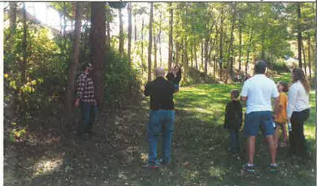
The zip line was enjoyed by kids of all ages