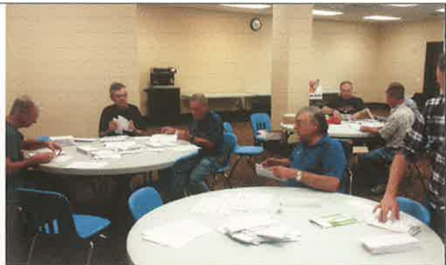
The Football Raffle tickets were sent to all members...go for it when you get your tickets