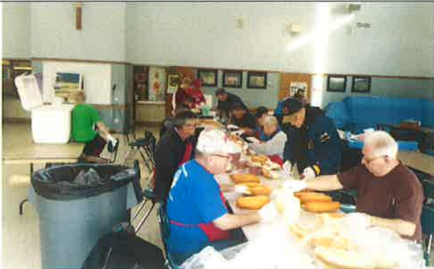
Plenty of hands were on deck to make sub sandwiches