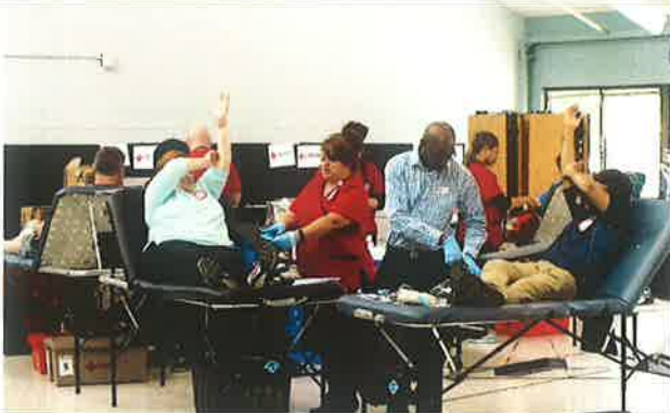
Once again, the Council sponsored a blood drive