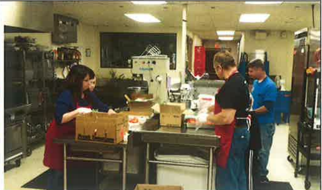
A good time was had by all