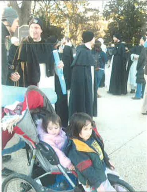
Pro Lifers of all ages