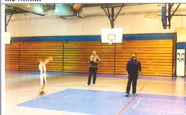
The Council Free Throw Competition