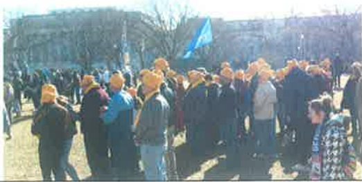
Many groups from all over