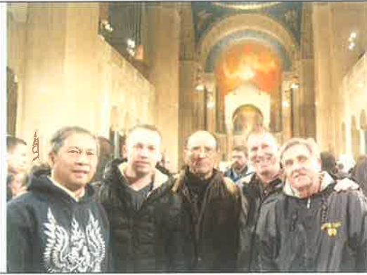
At the service in the Basilica of the National Shrine of the Immaculate Conception