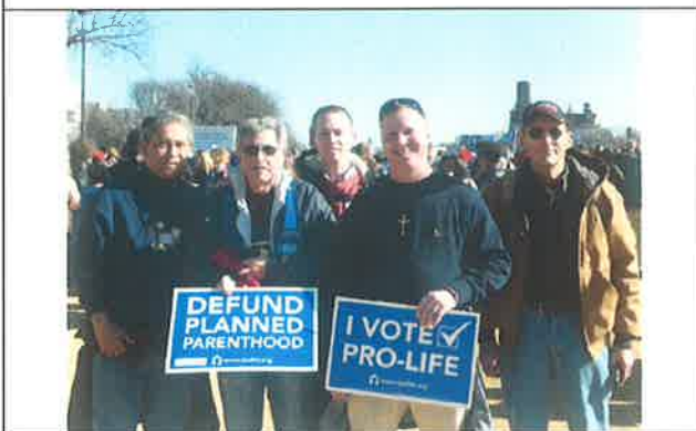
Our Council was well represented