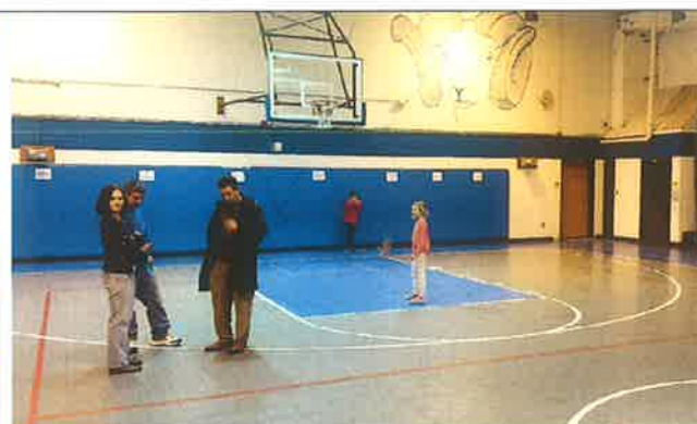
It was once again a success