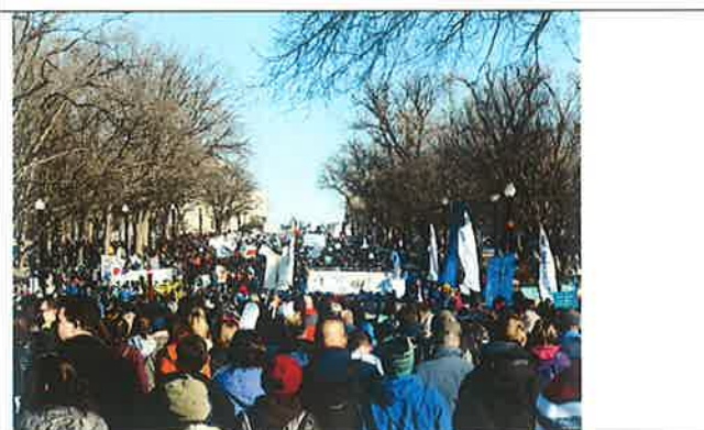
The crowd was inspiring