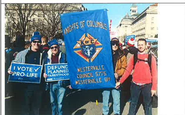
2018 March for Life in Washington, D.C.