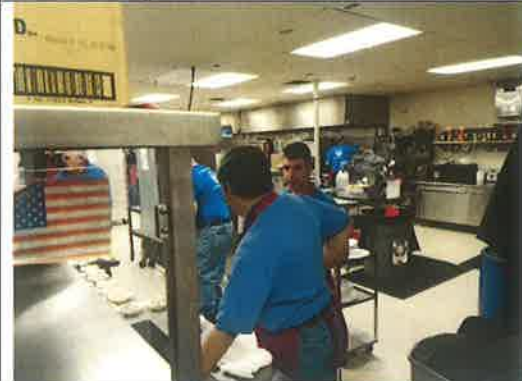
....as was the food preparation