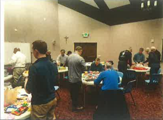
...but it was an intense effort