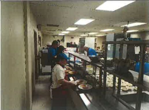
The teamwork serving food was flawless.....