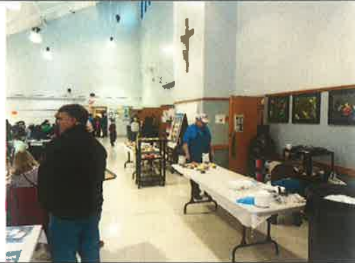
The desserts were excellent, raising $$ for scholarships