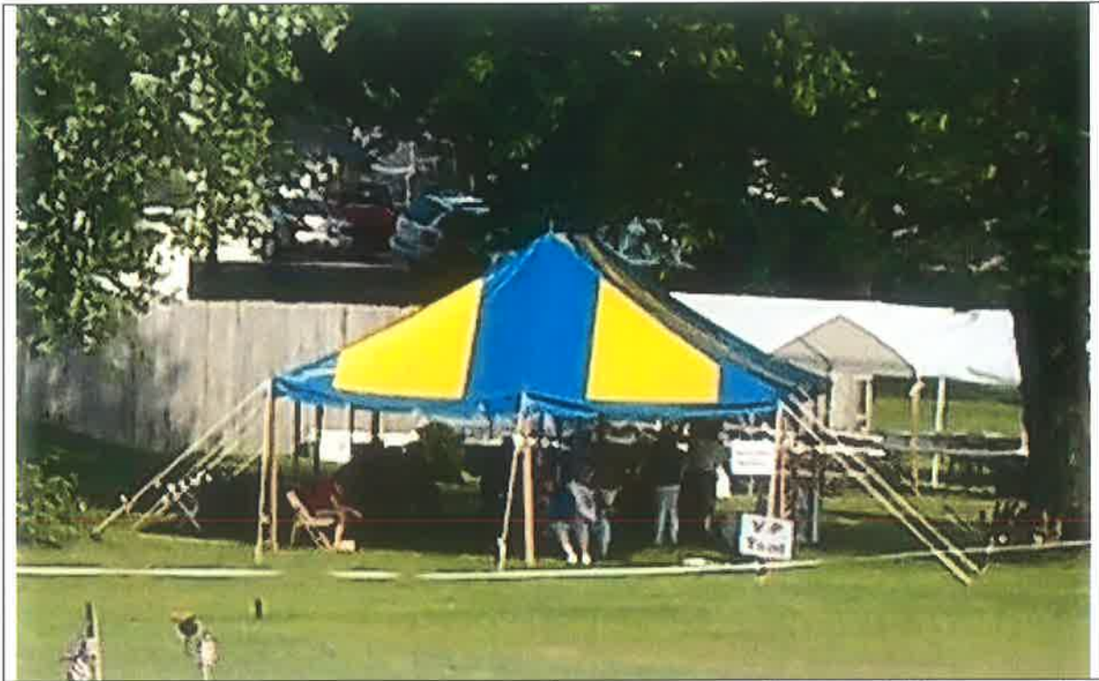
20 ft by 30 ft tent. Rental $375 for a weekend. It requires a flat area of 60 ft by 50ft for staking and supports