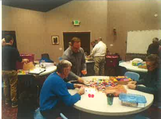
Many hands made light work of stuffing eggs with candy....