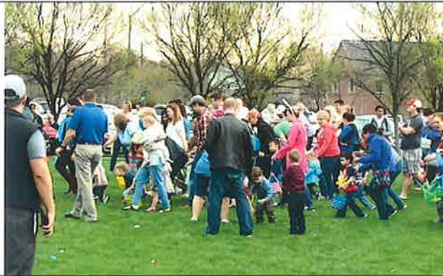
The crowd anxiously waited for the go signal and then hit the field.....