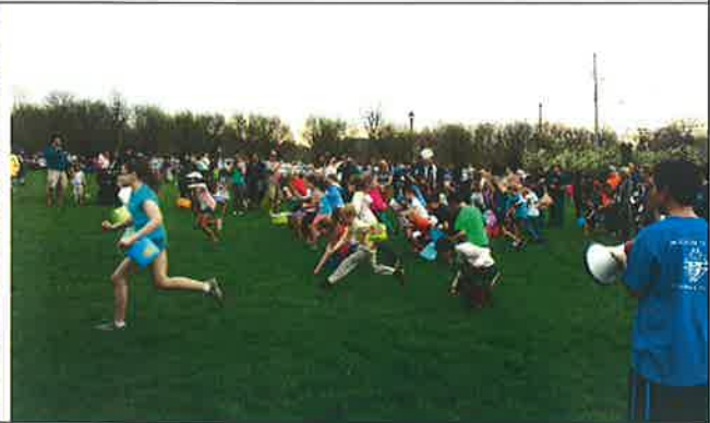
...and it was over in twenty minutes