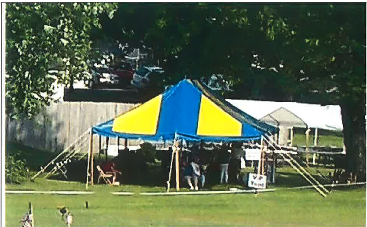
20 ft by 30 ft tent. Rental $375 for a weekend. It requires a flat area of 60 ft by 50ft for staking and supports