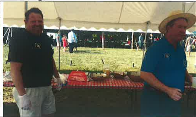
And the food