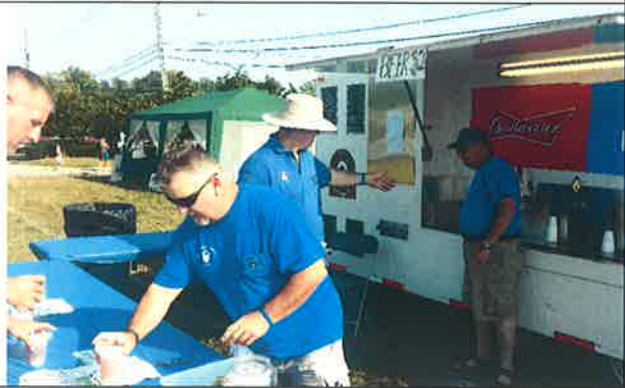
We also serve the beverages