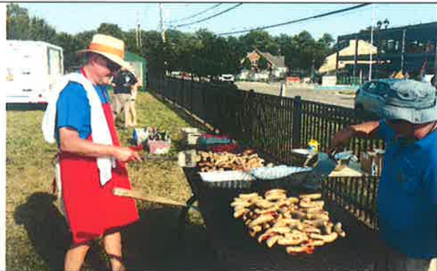
The Knights once again prepared food for the St. Paul parish picnic