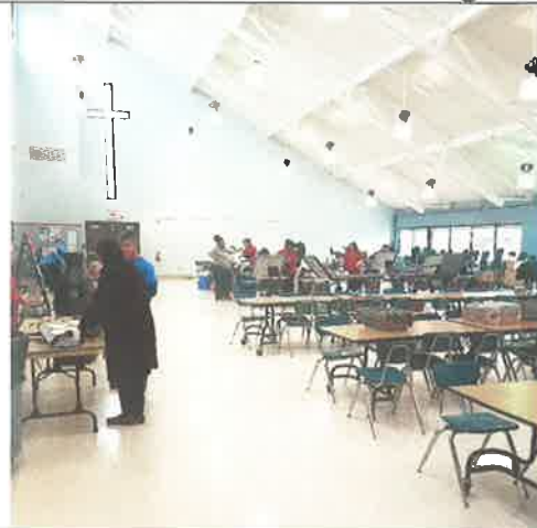
Once again, the blood drive was a success