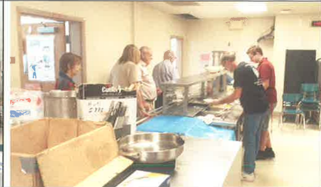
And the food was enjoyed by all attendees