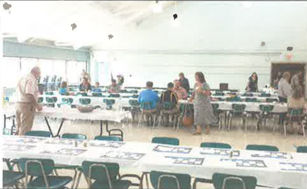
The breakfast was also a success