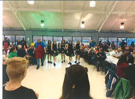
.... The lively entertainment