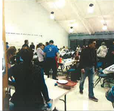
And the attendance has been an indication of the good food and service provided