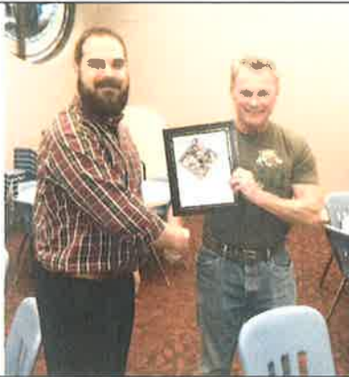
The Koonce family was selected Family of the Month