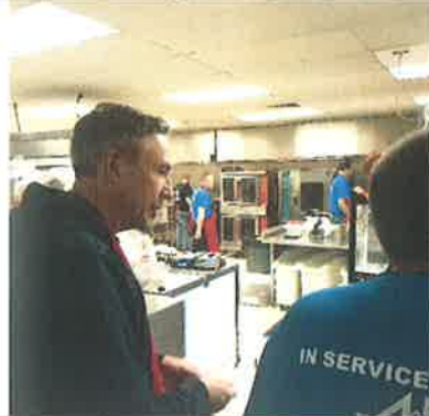
The effort of planning and food preparation has been rewarded