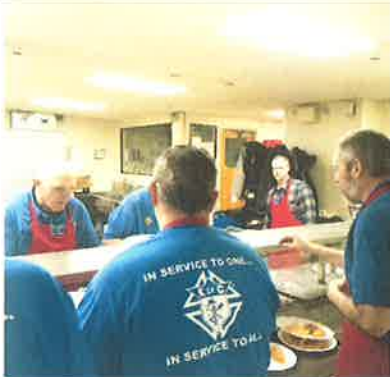
The effort of many members has made the fish fry's a success