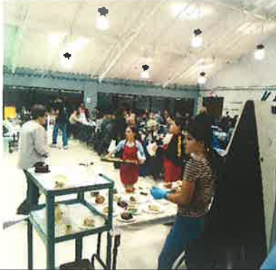
The outstanding service has been a family affair