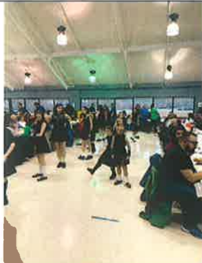
Not to mention .....