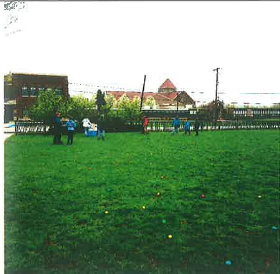
....they carefully spread them across the field.....