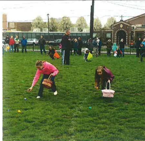
....and the field was clean in ten minutes