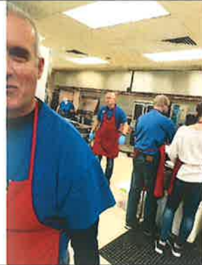
The professional staff took care of business at the April breakfast