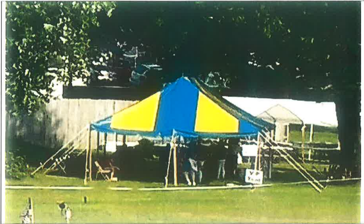
20 ft by 30 ft tent. Rental $375 for a weekend. It requires a flat area of 60 ft by 50ft for staking and supports