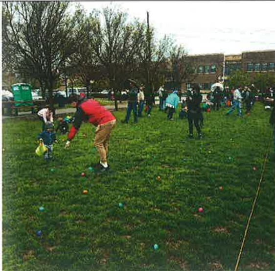
Then the kids took over.....