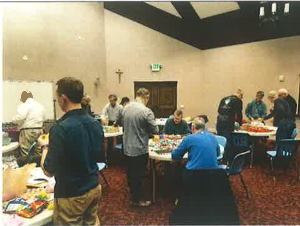
The Council stuffed hundreds of eggs for the hunt.....