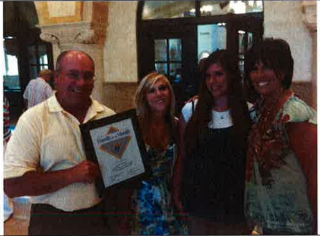
The Svitanas, Family of the Month