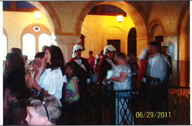
The 4 th Degree Honor Guard at the St. Paul dedication Mass