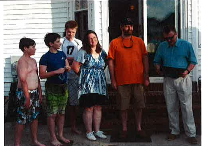
The Coffeys, Council Family of the Year