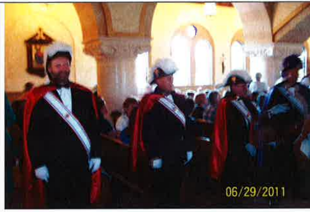
The 4 th Degree Honor Guard at the St. Paul dedication Mass on June 29.