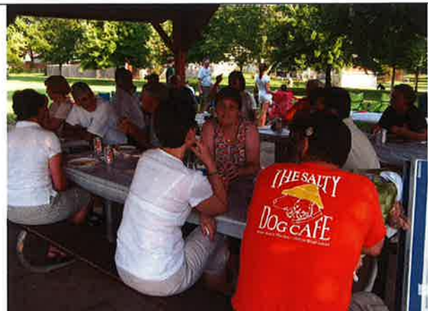
The Corn Roast was well attended.