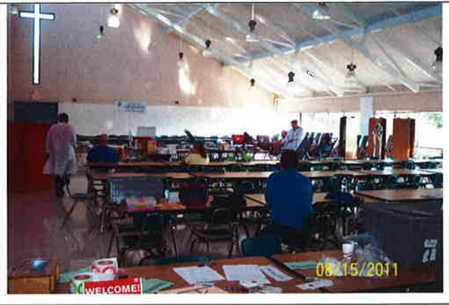
Tom Crotty watching over the Blood Drive on August 15