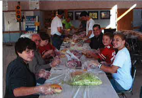
It was all hands on the table for the sub assembly line.....ANOTHER SUCCESS!!!